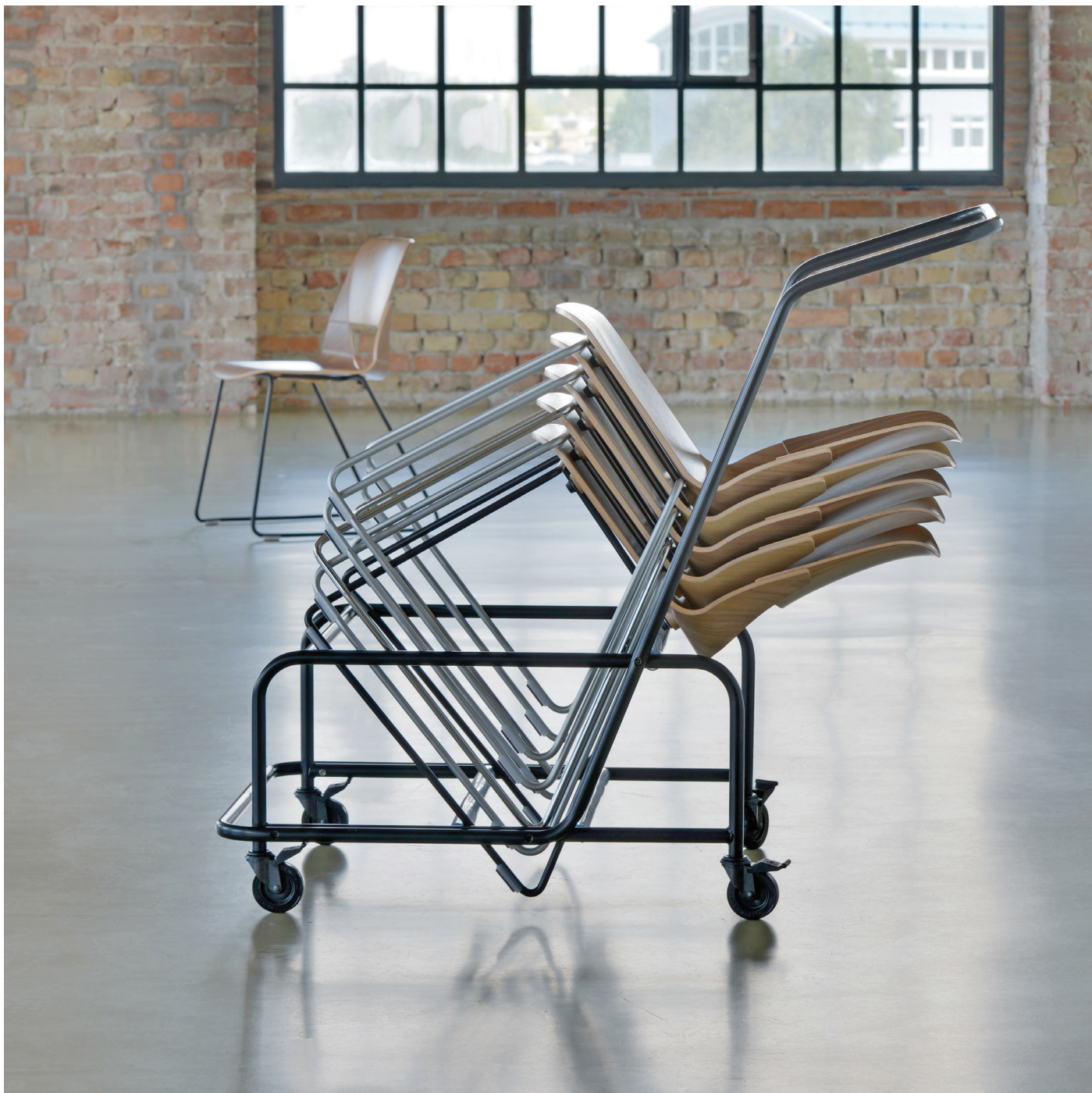
Frigate Stacking chair, 2018