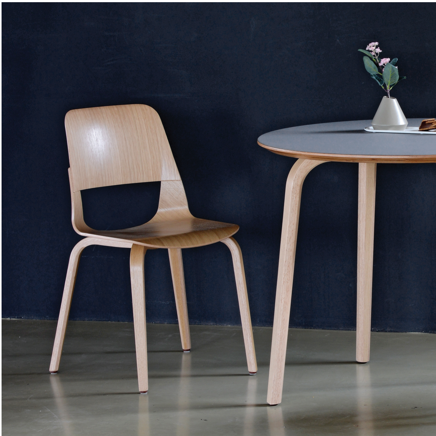
Frigate Chair, 2017